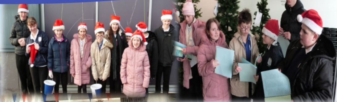
Christmas Carol Singing at Stubby Leas Nursing Home, John Lewis & Morrison's

Pupils from school went to perform Christmas songs and carols to entertain the residents of Stubby Leas Nursing home in Fisherwick. The residents and staff were delighted and have asked us back in the spring! We also visited John Lewis & Morrison's to entertain the shoppers, the pupils were all brilliant! A great time was had, well done everybody involved!