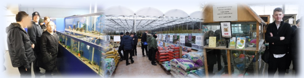
Students looked at the different enterprise activities at Planters Garden Centre