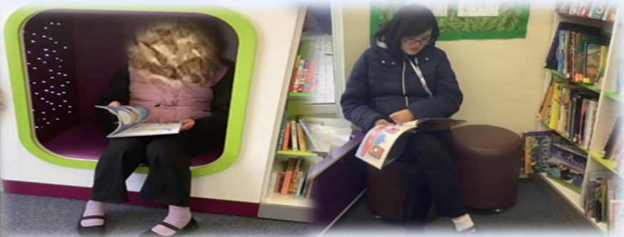
Community Visit: Polesworth Library

Tuesday afternoon's sixth form community visit group had a warm welcome from staff at Polesworth library. The students had a fantastic time looking through books and maps and then they chose a book which they had to scan before they could borrow and bring back to school.