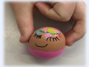
2 nd Elisha Wale