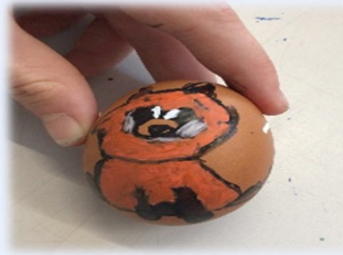
1 st Tyler Brown