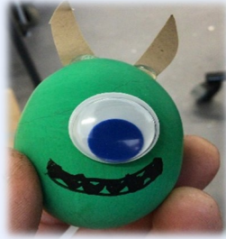
2 nd Xander Smith