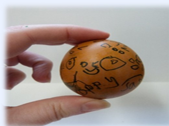
2 nd Carter Hill