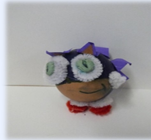
1 st Ashton Crutchley