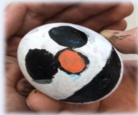
2 nd Lawrence Summers