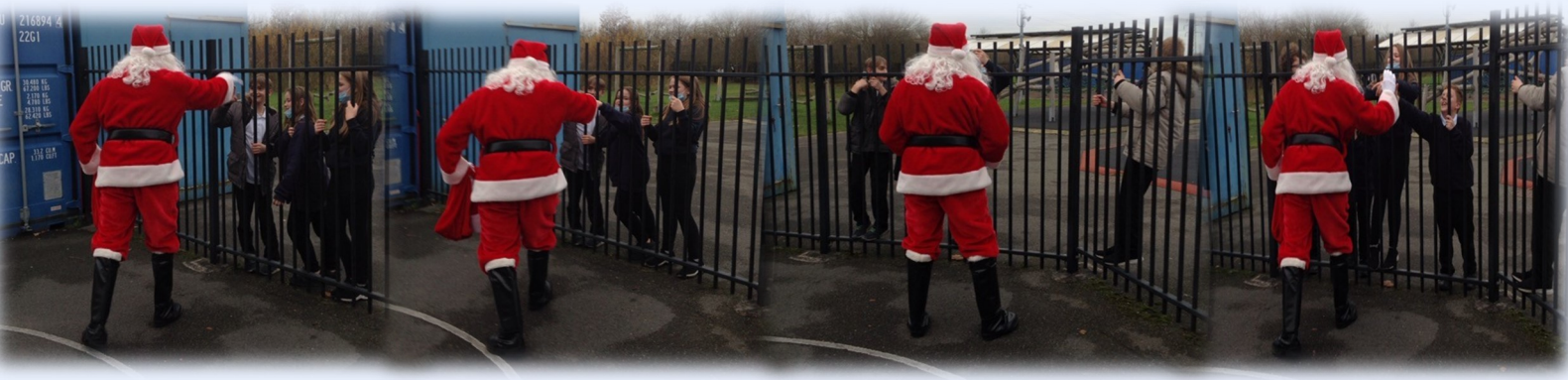
Some of our students had a surprise visit— Santa visited Nursery and said hello to a few high school students who were in the playground.

Students from Stellar have organised and implemented group led projects in Environmental studies. One of the groups was successful in receiving funding for recycling bins for plastic. These bins are now being used around the school building. Another group came up with the idea of purchasing refillable water bottles and selling them to pupils in school to raise money for Sea Turtles. These bottles will soon be on sale for pupils to purchase and will also help reduce plastic waste.