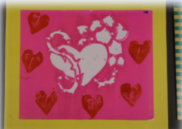
2 nd Kiar Chamberlain